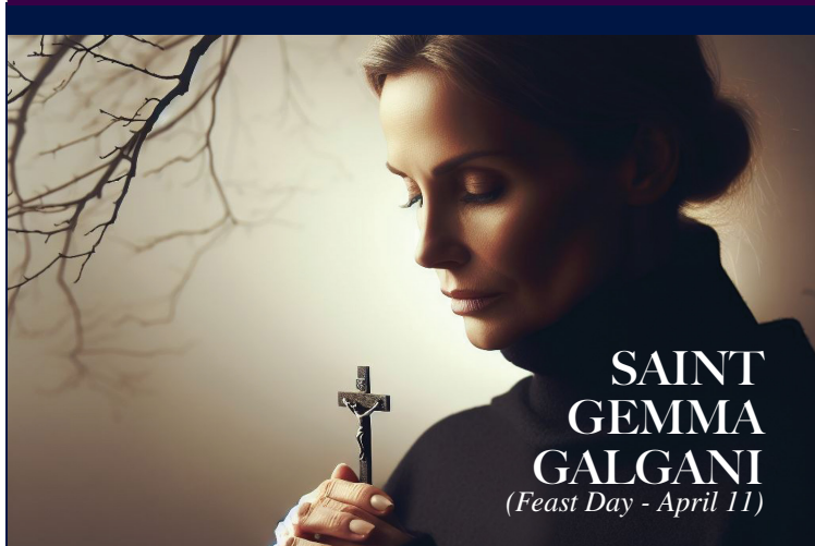
SAINT GEMMA GALGANI (Feast Day - April 11)

GEMMA GALGANI was born at Camigliano near Lucca, Italy, on March 12 1878. At twenty years of age, St. Gemma was attacked by tuberculosis of the spine. After countless novenas to St. Gabriel, she was completely cured on the first Friday of March, 1899. At this time, apparently free from her recent illness, she sought to fulfill her lifelong wish of pursuing her religious vocation with the Passion-ist nuns, but her application, as previously, was rejected.