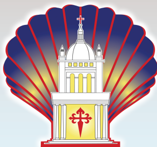
SAINT JAMES CATHEDRAL-BASILICA