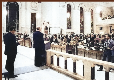
ST. JAMES CATHEDRAL ALTAR RAIL INTACT

In Orthodox churches, you can find a wall made of icons or a cordon, which divides the sanctuary from the rest of the building. Only chosen people are allowed to pass through the doors on the other side, where the altar is. We used to do the same thing back at the time in Catholic churches. The railings where people received communion were natural barriers in the space of the church. Only those who received holy orders and had a liturgical ministry could be in the sanctuary. The reason was to maintain order and show respect for the presence of God.